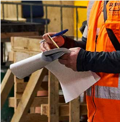
Figure out which early reporting tools suits you best. It could be as simple as printed out copies of the form in your staff room, trucks or with the supervisors.

If it makes sense, create an early reporting policy that covers who will manage reports, follow up issues and monitor your workers.