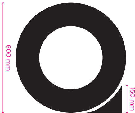
FIGURE 1: Wheel chock

A wheel chock should be approximately 25% of the diameter of your vehicle tyre and fit snugly into the tyre (eg a 600 mm diameter tyre would require a 150 mm high wheel chock).